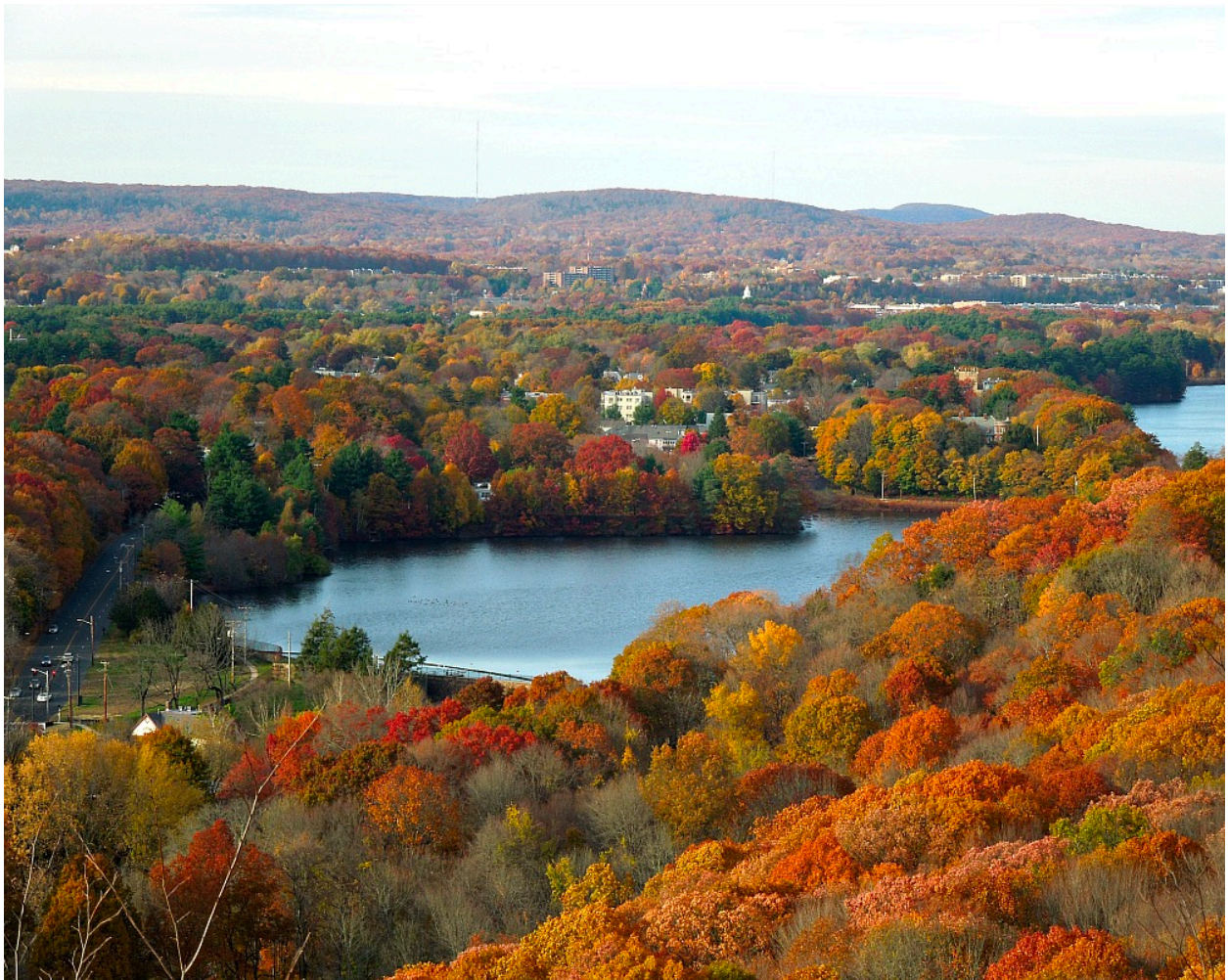
View from East Rock